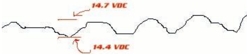
Figure D Sample Voltage Ripple

An ATV pilot would be surprised at how many different forms of electrical noise there are. Transient voltages, inductive spikes, load dumps and switching noise are just some of the noise that electrical engineers have to deal with on today's quads. For example, any electrical coil such as the coil in a starter solenoid, will send out a nasty voltage spike when power is removed from it, Fan motors turn into generators when power is removed from them, sometimes briefly putting out as much as 30 volts DC!