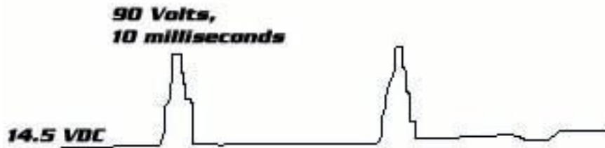
Figure C Voltage Spikes

When we talk about clean power, we mean electrical power that is free of excessive electrical “spikes” and “ripple”. A voltage spike is a high peak voltage of short duration and often originates from somewhere out in the vehicle electrical system. (See Fig. C) It can be negative or positive; it can be one time or constantly repeating. Ripple is the standard amount of voltage fluctuation that the regulator itself allows to pass through after it turns the AC from the stator into the DC (See Fig D). If electronic devices like cell phones or stereos are going to be tapped into the ATVs electrical system clean power is a necessity. Noisy power may cause damage or hinder the performance of an electronic device to the point that it is useless. If the only loads on the ATV are lights, ripple is not important—but voltage spikes can blow bulbs in a heartbeat. Read on to learn more.